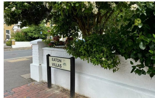
Garage at 10, Denmark Villas, Hove Asking price £70,000 - Freehold